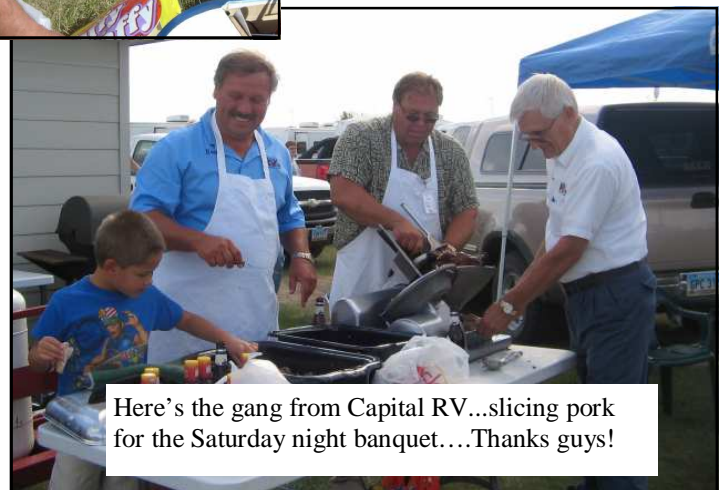
Here's the gang from Capital RV...slicing pork for the Saturday night banquet....Thanks guys!