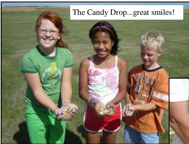
The Candy Drop...great smiles!