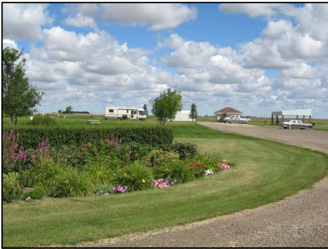
The flowers and grounds at the flying field were beautiful during August.....what a beautiful sky...only in North Dakota!