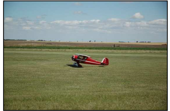
Two perfect landings captured side by side....