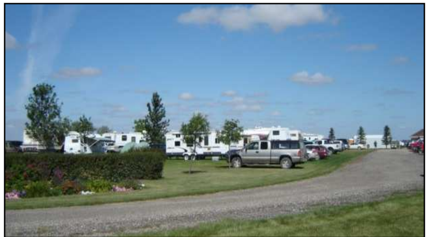
Here is one of the many pictures Garnet Burke took of the Fun Fly. This is a picture of the campers who attended the 2005 Minot International Thanks Garnet!