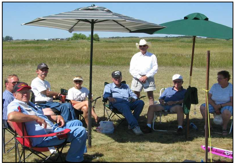
“The Gainsborough Gang”